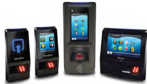
THE SIGMA FAMILY

With the entire SIGMA Family, integrators have a complete range of biometric terminals at their disposal, compatible with each other, to secure any kind of use case scenario – whether indoors or outdoors – with the World's most accurate fingerprint technology.