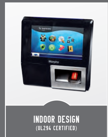
INDOOR DESIGN (UL294 CERTIFIED)